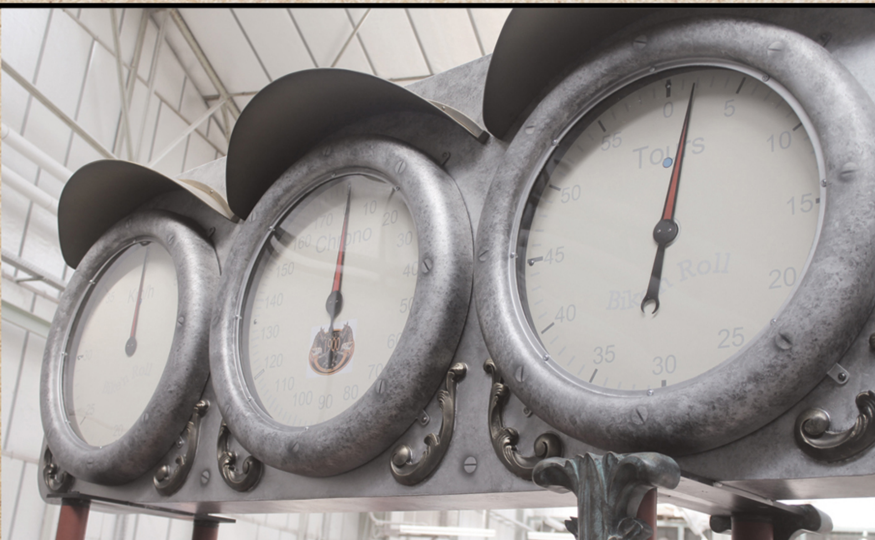
Speed control dials:

Concept1900 Entertainment Place Paul Doumer 02410 Saint Gobain France www.concept1900.com